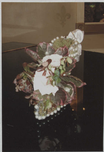
nd Babbis Grace