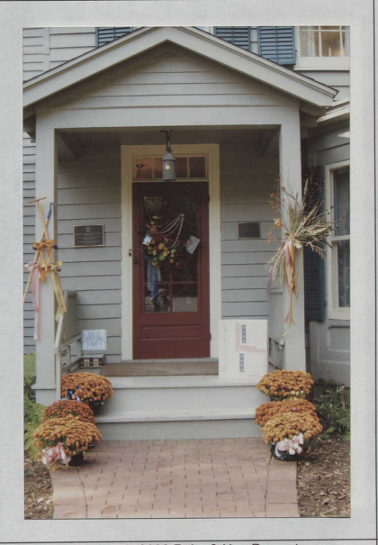
October 8, 2008 Rake & Hoe Presents A Small Standard Flower Show at Hetfield House