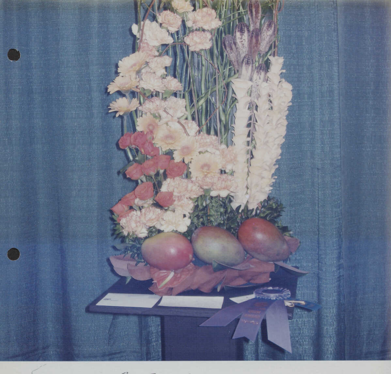
GCNT-2-12-69 -TOP AWARDS TO OUR OWN Klay GOSS